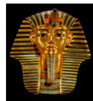
Reign of King Tut